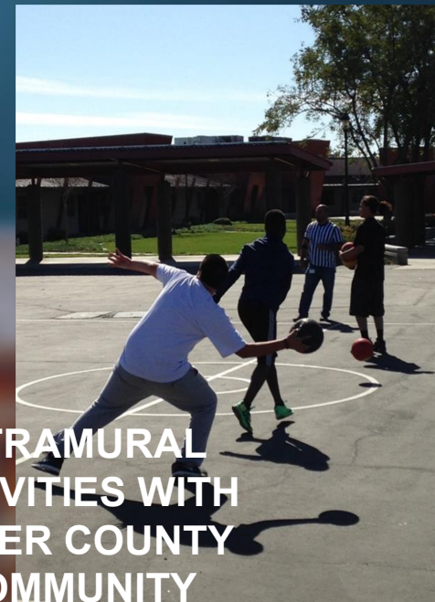
INTRAMURAL ACTIVITIES WITH OTHER COUNTY COMMUNITY SCHOOLS

Probation partners with SB County Schools and has a community school at each DRC site.