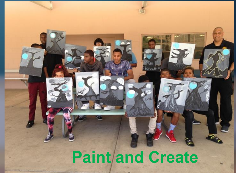
Paint and Create