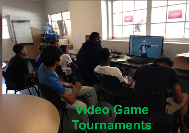
Video Game Tournaments

Summer Day Camp provided fun activities, meals, trips, and component classes for youth. It also provided youth a positive environment for the summer.