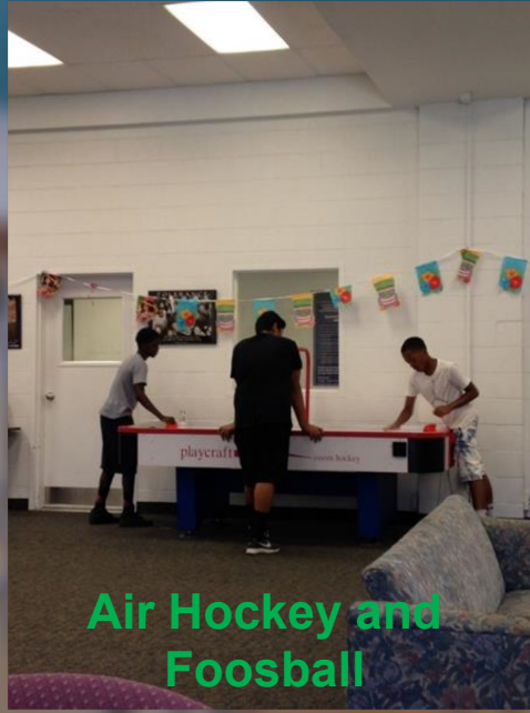
Air Hockey and Foosball