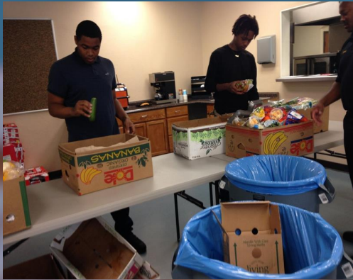
Salvation Army Food Bank