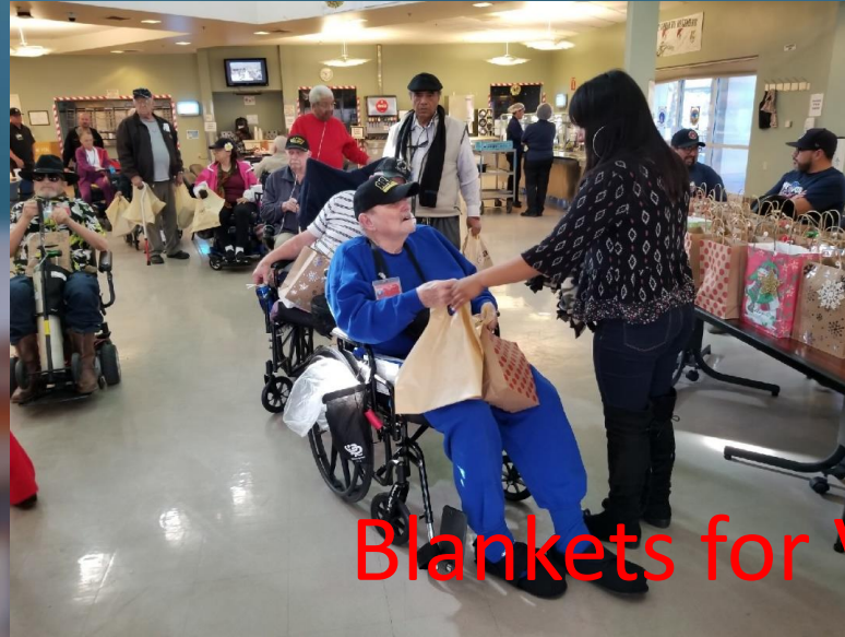
Blankets for Veterans Center