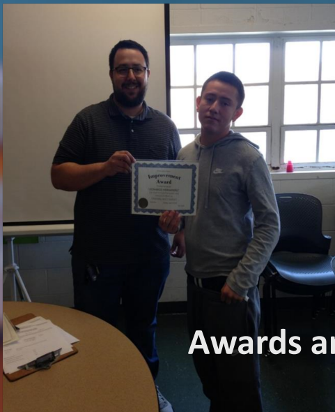
Awards and Incentives